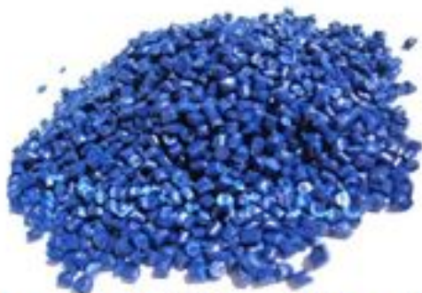
Image 6 showing plastic granules from which plastic bags are manufactured