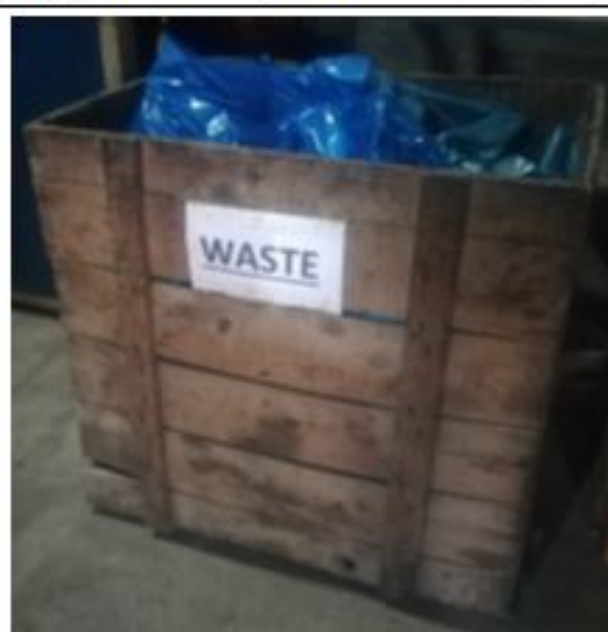
Image 1 showing Collection box for collecting polythene waste generated from production processes

When the Recycle Box is filled up, the contents of the box will be packed and stored in the Storage Area (shed-area adjacent to the Production Hall: see image 2).