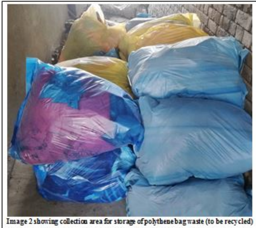
Image 2 showing collection area for storage of polythene bag waste (to be recycled)